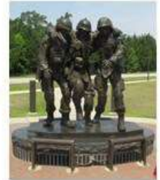
Hope for the Warriors