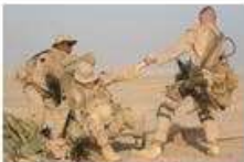
Marines Helping Marines