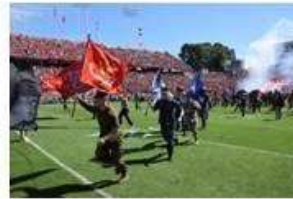
NROTC - JNROTC