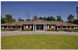
Fisher House Wounded Warriors Battalion East